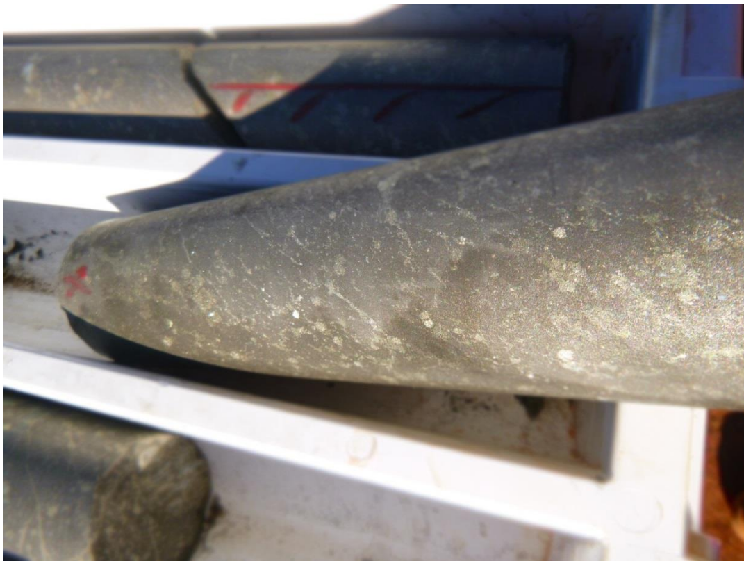
Figure 2: Detailed photo of massive sulphide zone from hole DKMDD005