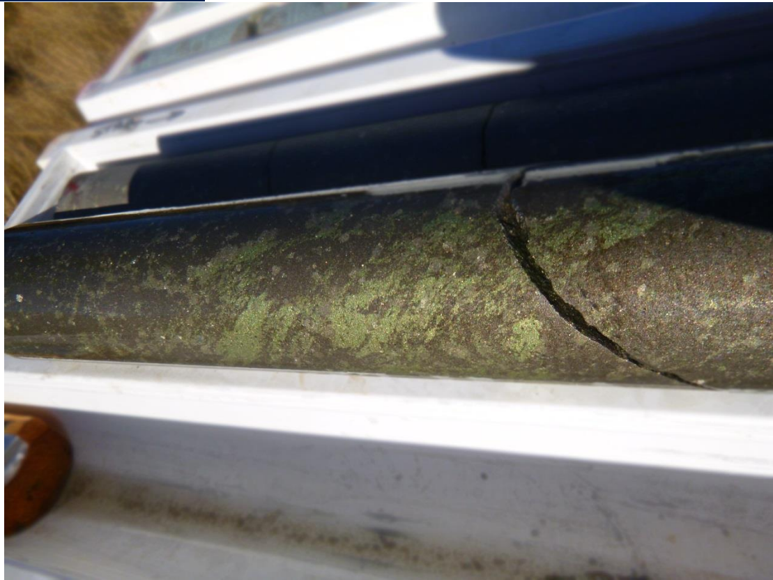
Figure 3: Detailed photo of massive sulphide zone from hole DKMDD005