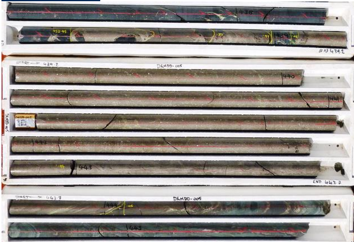
Figure 1: Photo of massive sulphide zone from hole DKMDD005